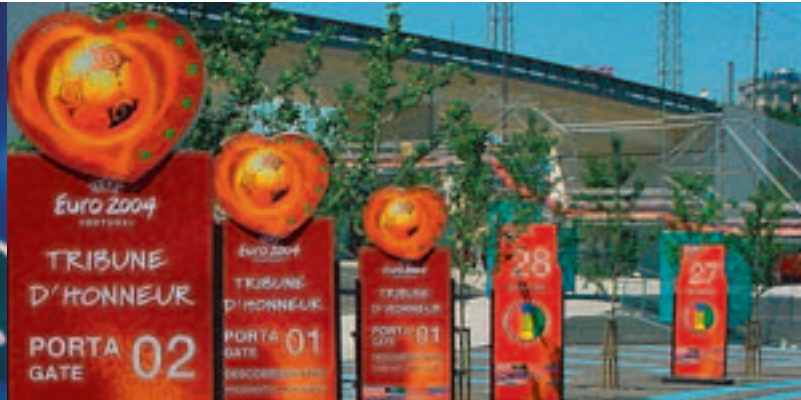
Signage in the soccer stadium in Portugal FOREX®classic