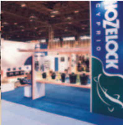
Exhibition stand FOREX®classic