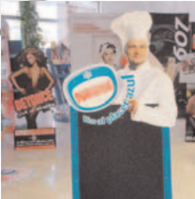
Advertising signs FOREX®classic