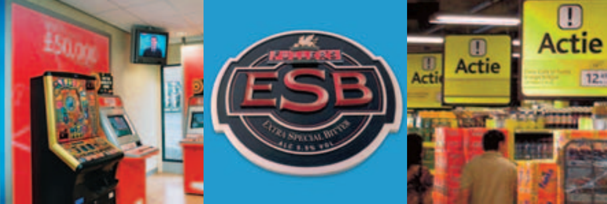
Shop fitting, interior design FOREX® classic